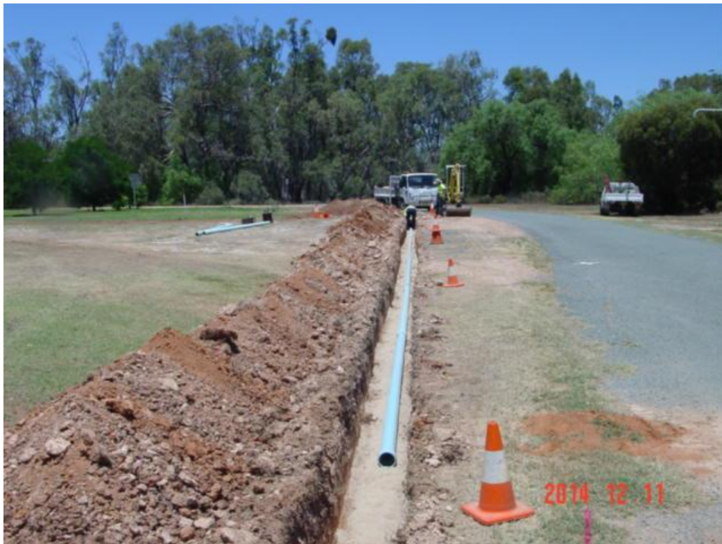
Malcolm St Water